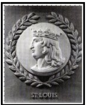
Image of St. Louis (King Louis IX) also found in the U.S. House of Representatives.

The history of the Inquisition was once well known, especially by Protestant Christians in America and England, and the things documented here were taken for granted. It is only once history was rewritten in the 19th and 20th centuries that Christians began to forget what their forefathers had always understood.